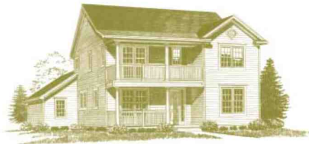
Colonial with upgrade

The Wisteria House, Plan 6660 2,927 finished square feet 3-5 bedrooms 3 baths Detached garage