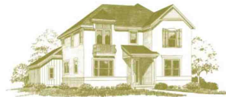
French with upgrade