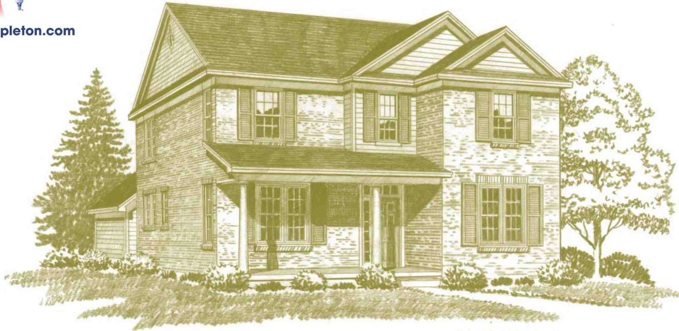
Colonial with brick option

Never again will you hear "Mom, she won't get out of the bathroom!"