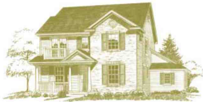
Colonial with upgrade