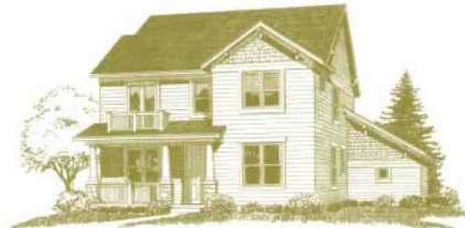
Craftsman with upgrade

Let's see ... four bedrooms and a kitchen pantry big enough to hold most of the breakfast cereals the kids see advertised. A study where you can close the door and work without having to yell. "Hey, can you keep it down a little?" And a style that looks good even when the floor is covered in dirty clothes and building blocks. Oh yes, and tucked away – a nice big bathtub. Aromatherapy products not included.