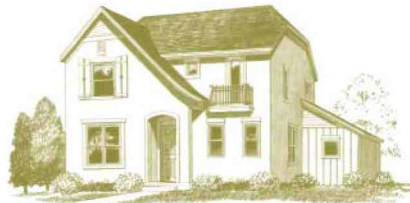
French with upgrade

Here's a home that has its accents down pat. The French elevation employs Mediterranean-style windows, decorative shutters, and a gently curved roof above the front door to greet visitors with an air of European grace. While the clapboard siding and big front porch of the Farmhouse elevation speak with the relaxed, easy rhythms of an American original.