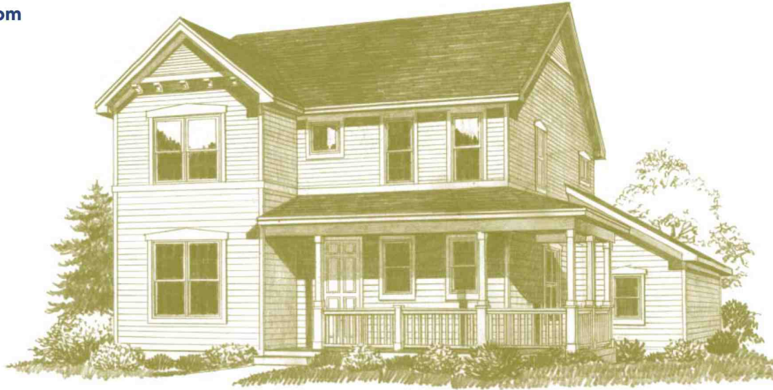
Farmhouse with upgrade