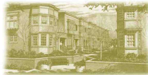
Tuck-Under Paseo Row Home

The window seat has long been appreciated as the ideal place to sit and ponder what it means to be human. Or feline. It works in either case, since a soft cushion and a good view encourage both deep thoughts and little cat naps. The window seat in the master bedroom of the Downing is cantilevered, which means it sort of hangs out over the window below. The cantilevered window seat is a romantic feature you don't often see in new homes. But in the Downing, it feels as natural as snoozing on your back with your paws in the air.