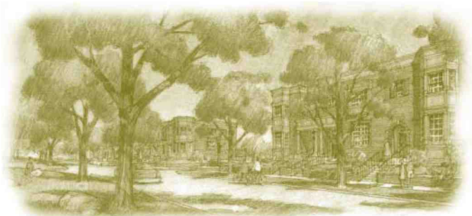
Tuck-Under Avenue Row Home