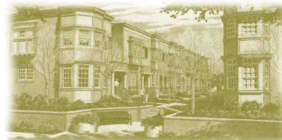
Tuck-Under Paseo Row Home

The Clarkson isn't a two-bedroom home. It's a two-master bedroom home. Whoever has the pleasure of living here gets a spacious bed chamber, a private bathroom and a walk-in closet. The Clarkson is filled with generous, visually interesting spaces — a two-story bay window, a roomy kitchen that flows into a big dining/family room, a living room with a 12-foot ceiling. And with no secondary bedroom, this home has no second-class citizens.