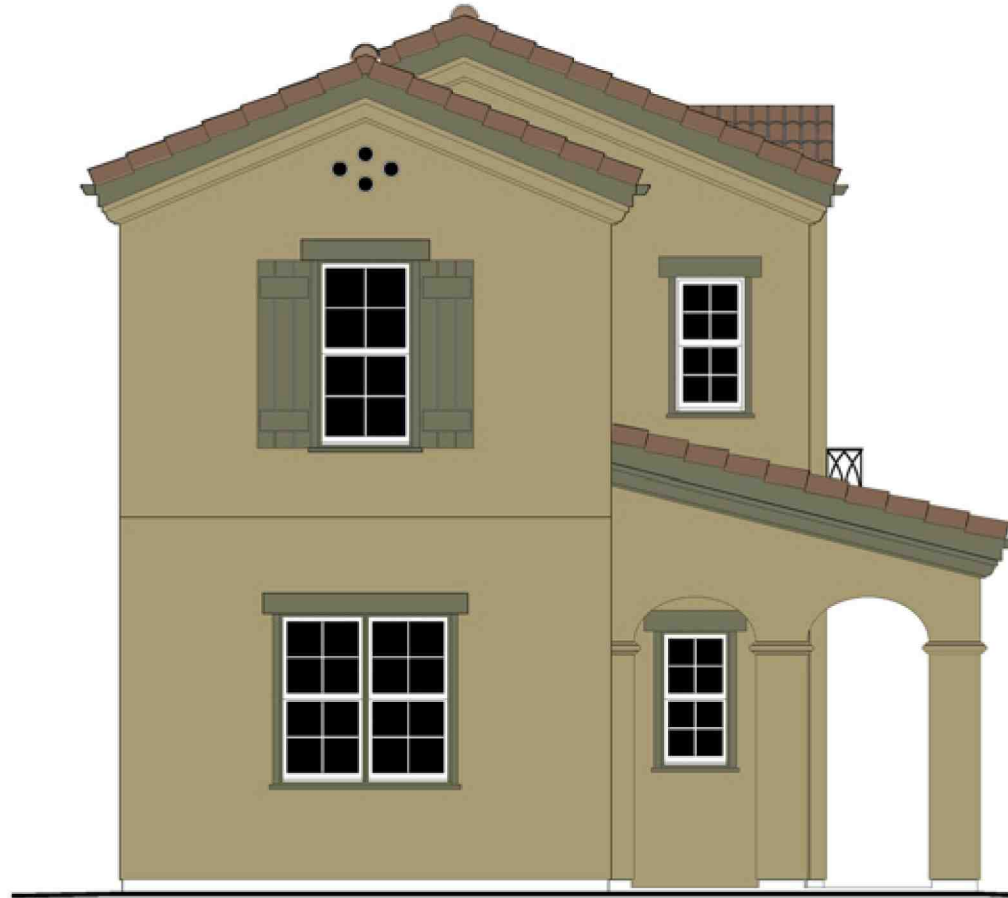
Elevations 1 & 2 (differ only in garage orientation)