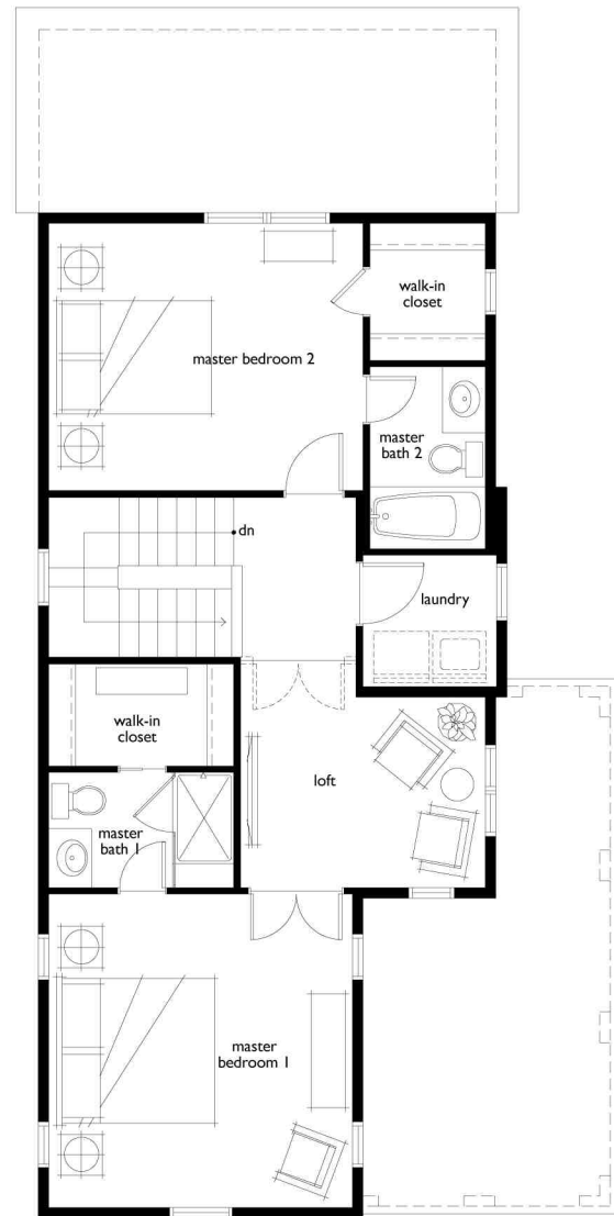
Upper Level-Elevation 1