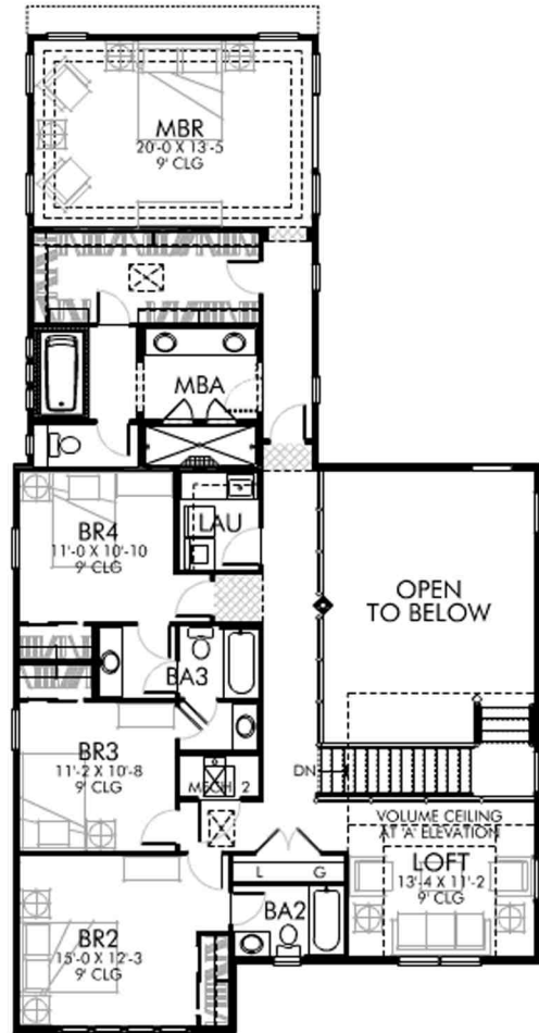
UPPER LEVEL STANDARD PLAN - 'A' ELEVATION 1741 SF